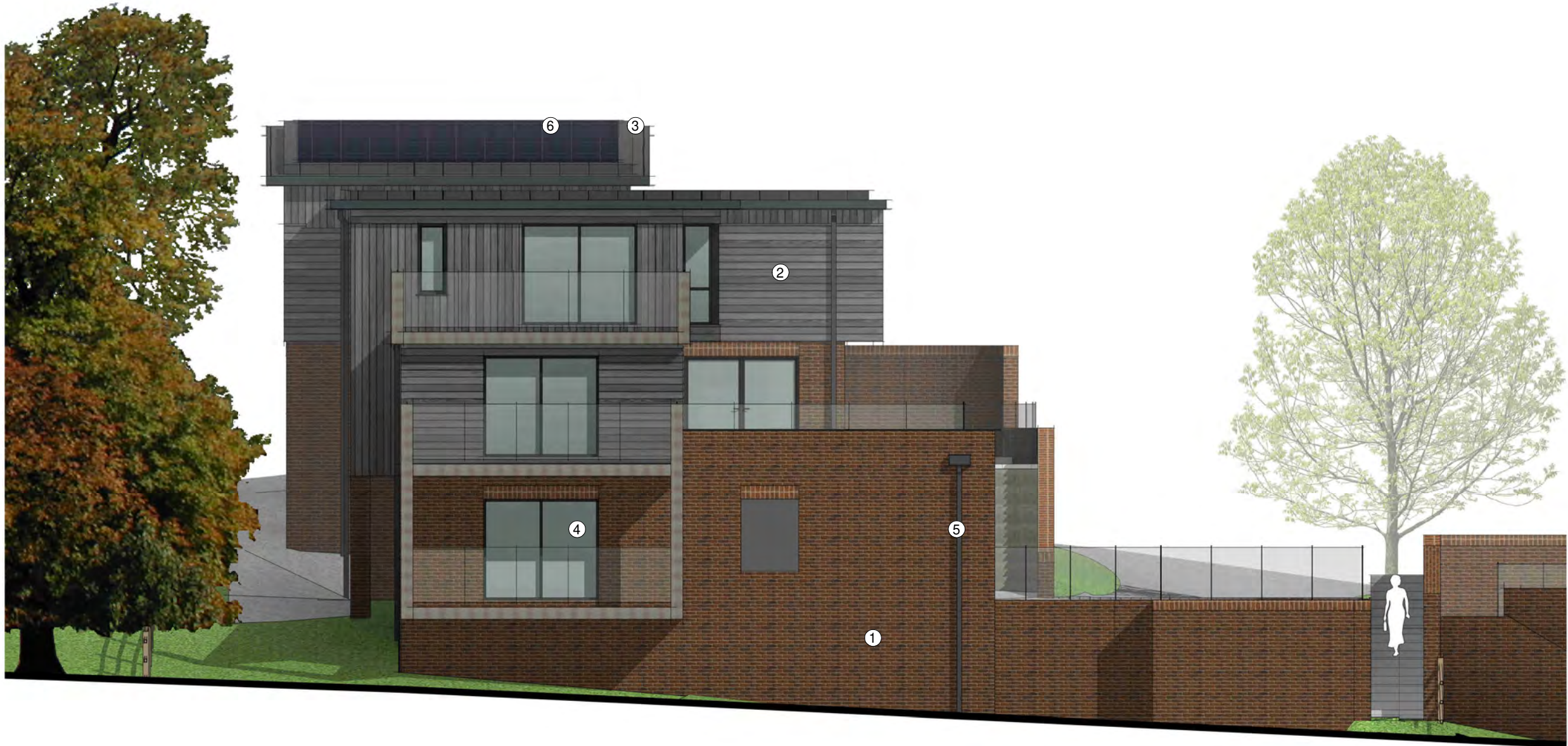
House 2 - South East Elevation 1 : 100