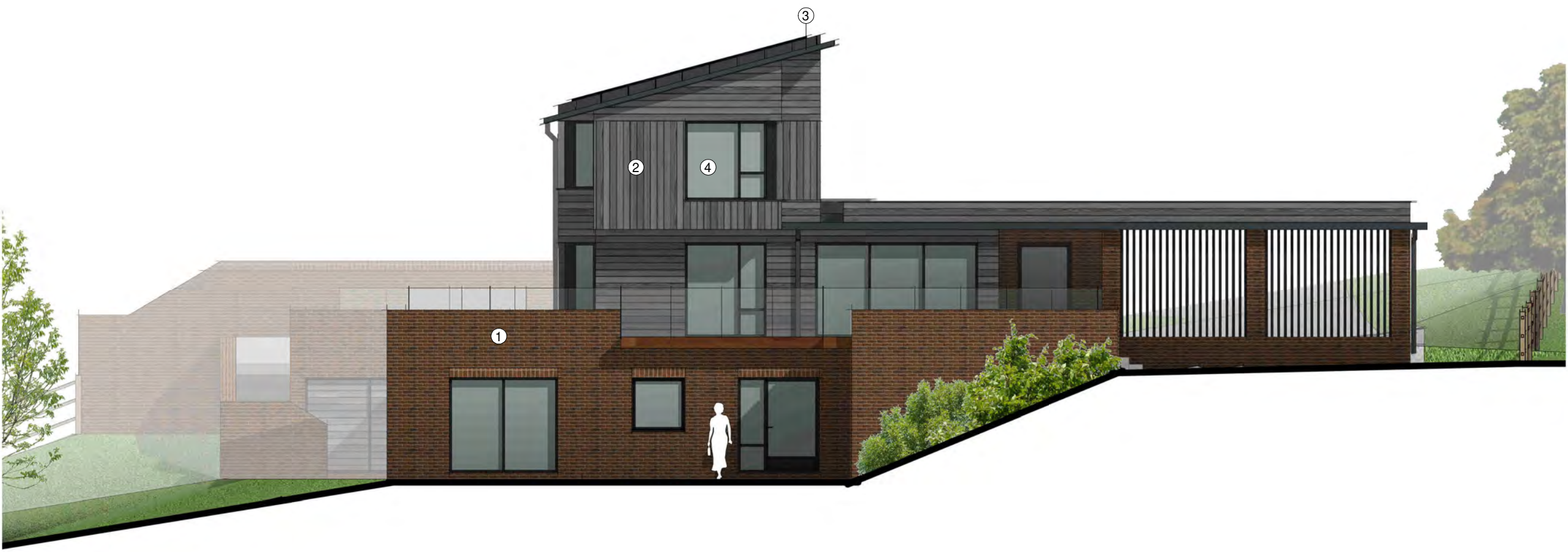
House 3 - East Elevation 1 : 100