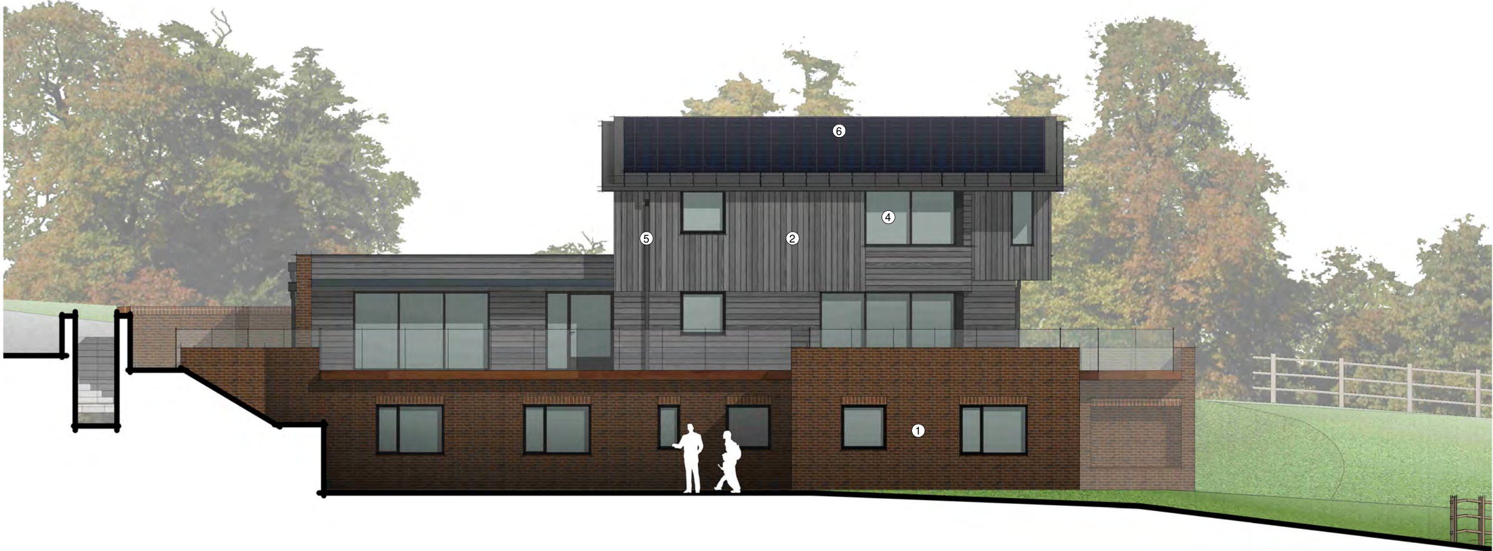
House 3 - South Elevation 1 : 100