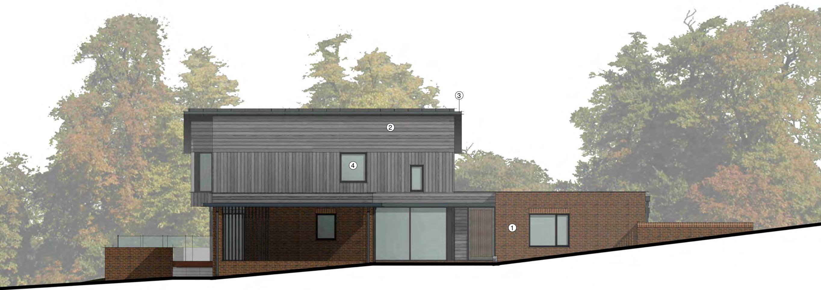
House 3 - North Elevation 1 : 100