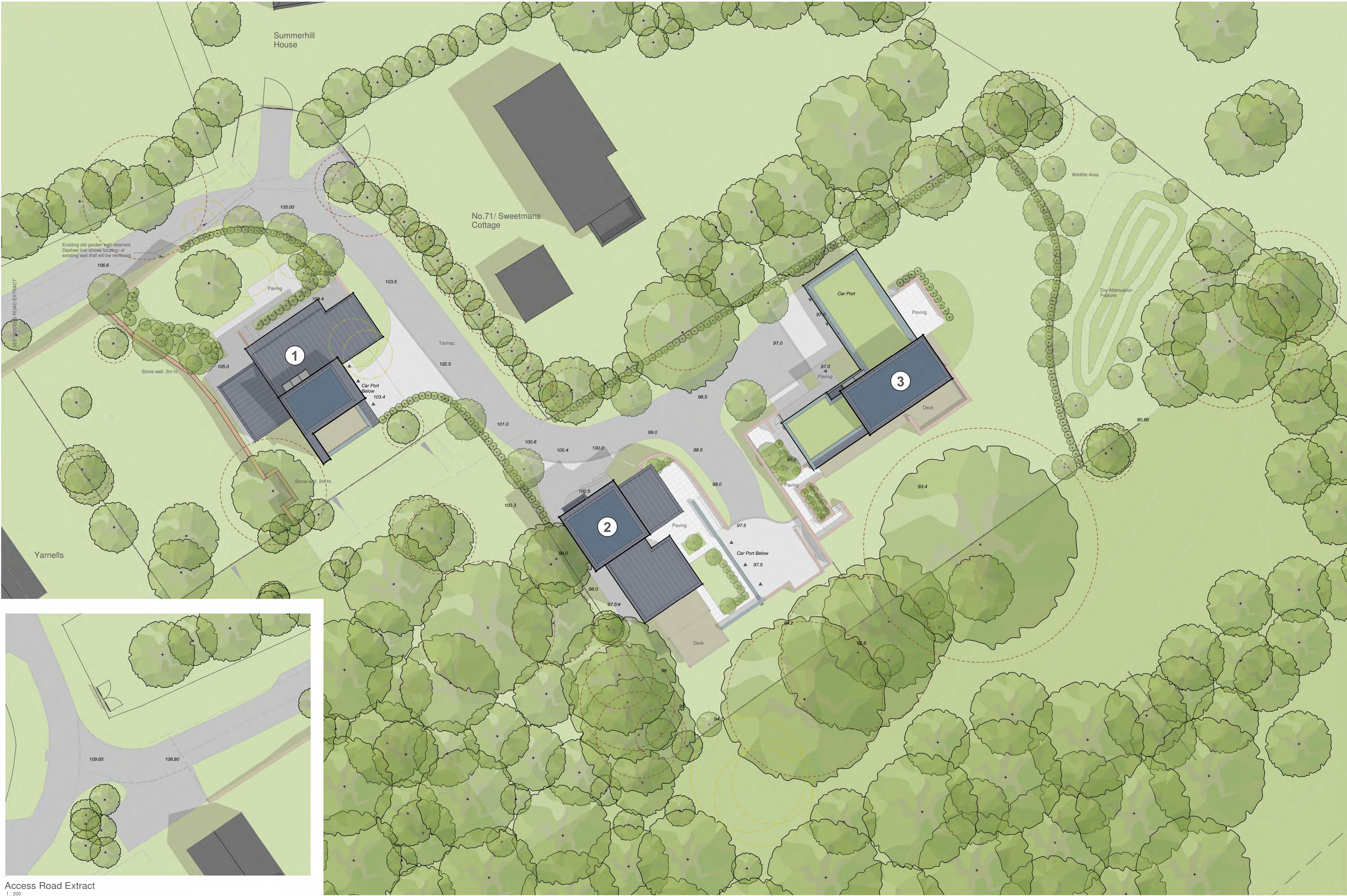
Access Road Extract 1 : 200

Planning This drawing has been prepared for workstages up to planning application purposes only and is not intended for construction. The scale bar should only be used to check the drawing has been reproduced to the correct size. No responsibility can be accepted for errors made by others in scaling from this drawing. Tyack Architects Ltd own copyright of the original design work in the drawings, documents and digital files which cannot be copied, loaned or disclosed without written agreement. Please refer to our Standard Terms of Business. Scale 1:200 10m