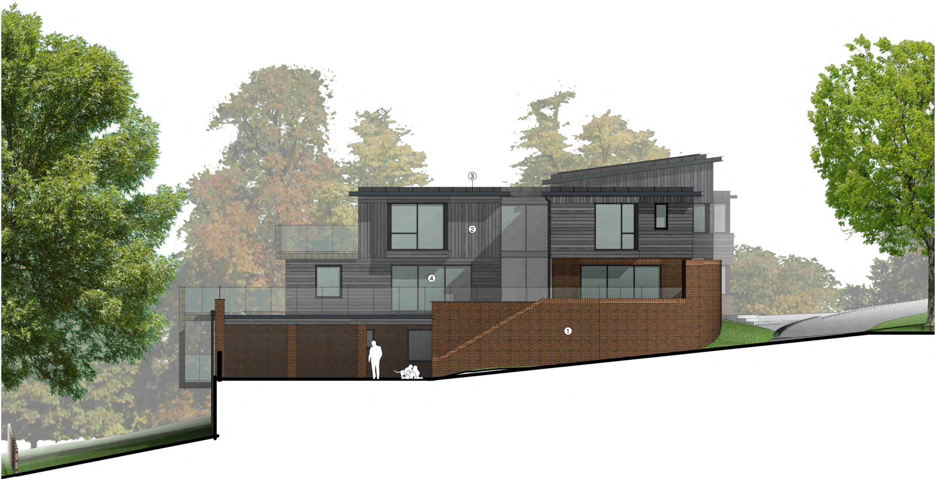
House 2 - North East Elevation 1 : 100