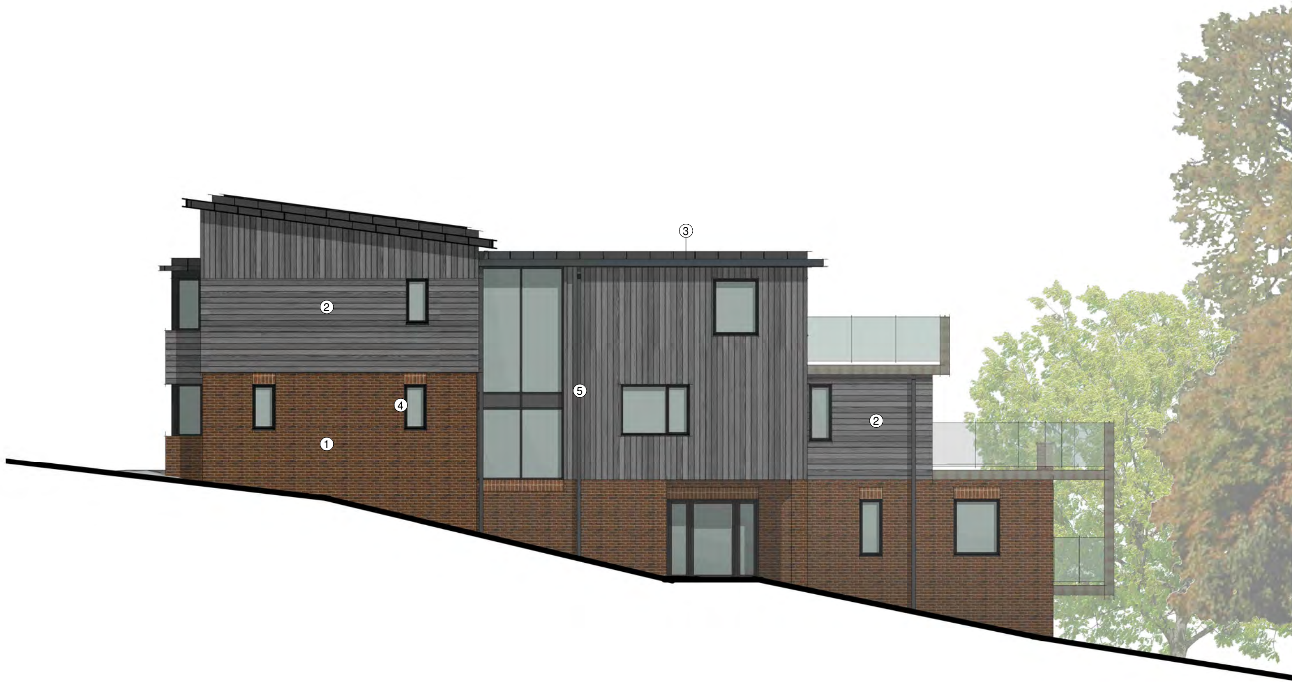
House 2 - South West Elevation 1 : 100