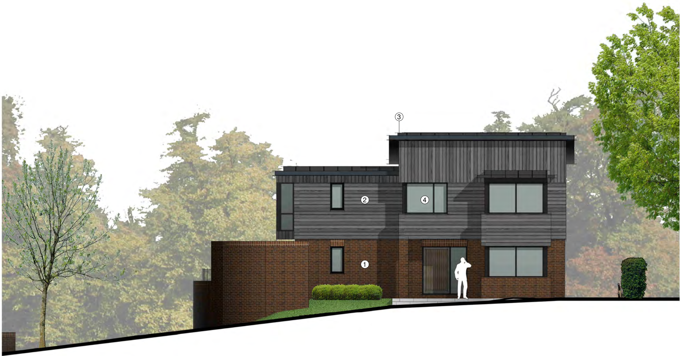
House 2 - North West Elevation 1 : 100