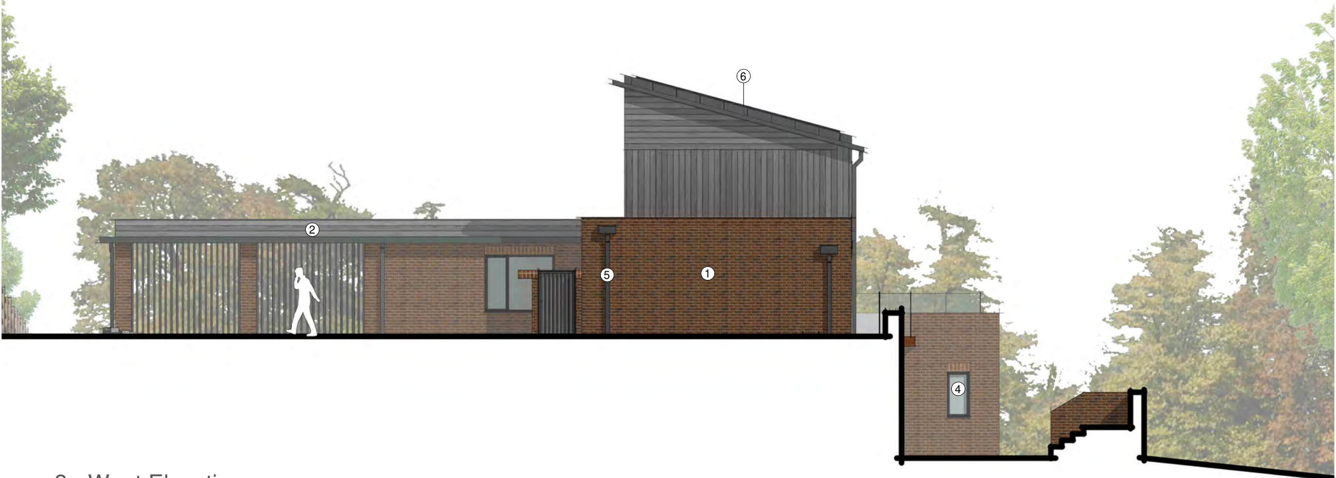
House 3 - West Elevation 1 : 100